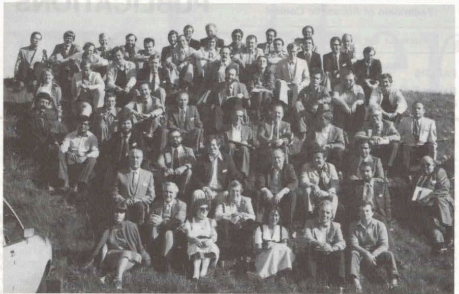
Programming and Optimization seem to have had satisfying results - certainly as far as the weather and the environment were concerned.