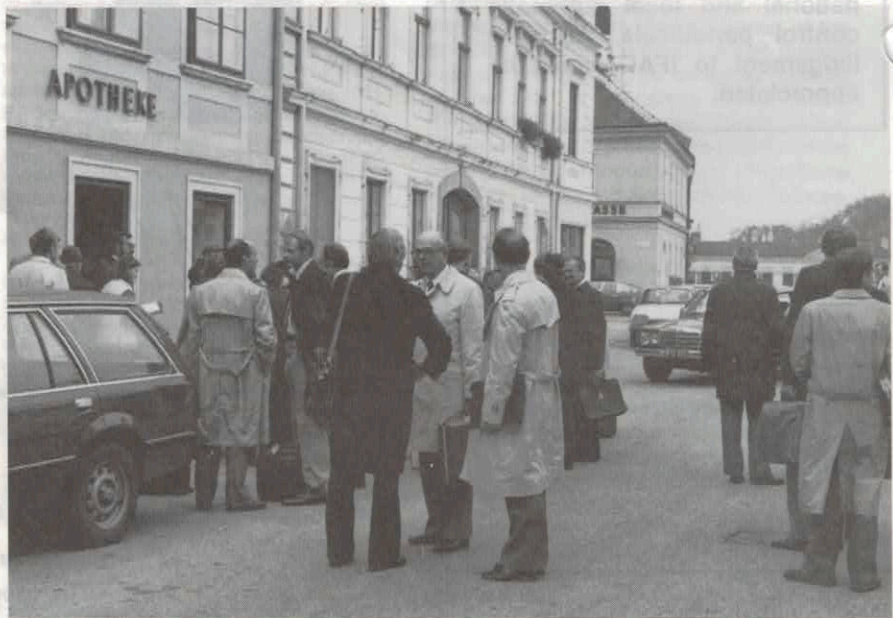
Laxenburg — The road in front of the IFAC Secretariat crowded with IFAC Officers taking a break between two meetings last November.